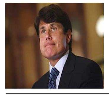
New NU President Credits Victory to Owning a lot of Purple