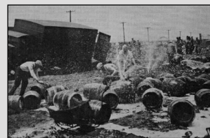
SAE Rum Runners Fall into Lake Michigan during June Heat Wave, Die of Hypothermia