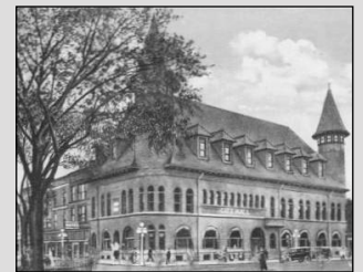
Prohibition Ends, Evanston Unaffected