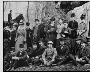
Class of 1924 Sets New Diversity Record of 3

The most outstanding aspect of the hall, though, is that it is already being looked at by Chicago Mayor William Hale Thompson as inspiration for new public schools. Thompson said that the design of Kresge Hall, created by architecture firm Holabird, Root & Burgee, "would be the perfect blueprint for schools in the inner city."