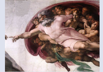
Manti Te'o, Notre Dame Reveal God is a Hoax

In related news, a new measure aimed at restricting the sale of automatic weapons to the mentally ill was struck down by 84% of the Senate.